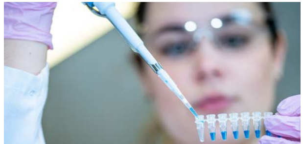
Scientist performing stem cell research for cancer therapy